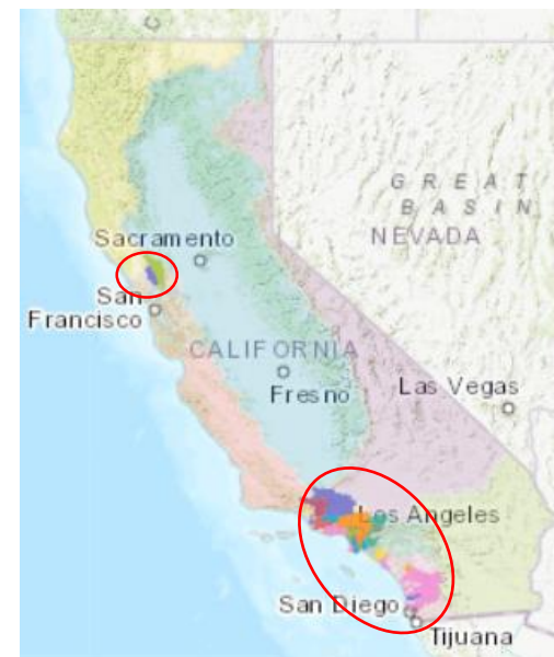
The Water Board's IGP map tool (pictured above) highlights areas that are subject to TMDLs.